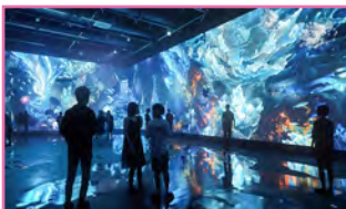
MUSEUMS AND SCIENCE CENTERS