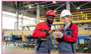
MANUFACTURERS AND SUPPLIERS