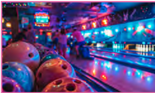
FAMILY ENTERTAINMENT CENTERS