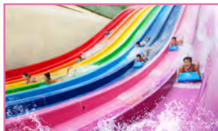
WATER PARKS AND RESORTS