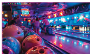
FAMILY ENTERTAINMENT CENTERS