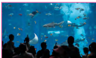
ZOOS AND AQUARIUMS