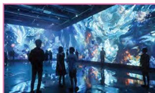
MUSEUMS AND SCIENCE CENTERS