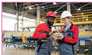
MANUFACTURERS AND SUPPLIERS