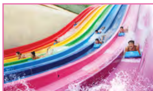
WATER PARKS AND RESORTS